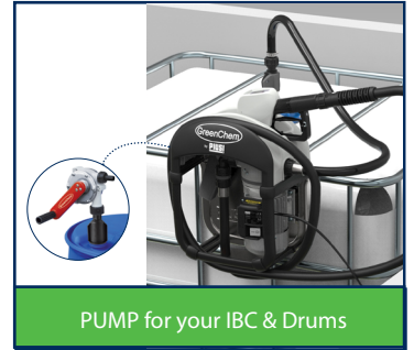
PUMP for your IBC & Drums