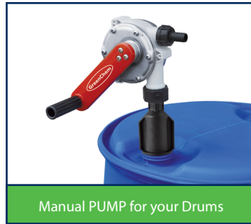
Manual PUMP for your Drums