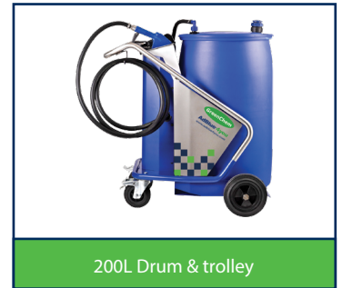
200L Drum & trolley