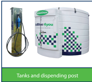
Tanks and dispensing post